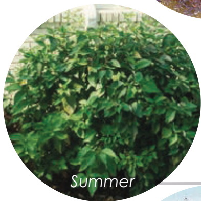
Bud's Yellow Dogwood ( Cornus sericea ) 6' H x 6' W Bloom Time: May-June