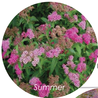
Anthony Waterer Spirea ( Spiraea x bumalda ) 4' H x 4' W Bloom Time: June-August